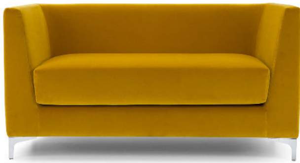
Lincoln 2 seater sofa